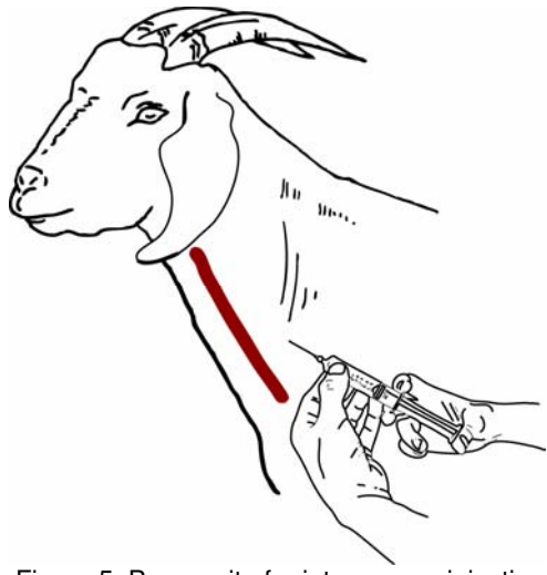
Figure 5. Proper site for intravenous injection Illustration used with permission from the Meat Goat Production Handbook, Langston University, 2007. Drawing by K. Williams.

All animals will require injections, such as vaccines or antibiotics. Proper dosage, equipment, and technique are essential to prevent drug resistance, minimize animal stress and prevent injection site lesions. Drug labels should be read to determine the correct amount of medicine to give and to correctly calculate dosage of the injectable solution. Proper syringe and needle sizes will ensure the correct amount of drug given in an effective manner. The three main types of injections are subcutaneous (SC, under the skin), intramuscular (IM, in the muscle) and intravenous (IV, in the vein). Only experienced animal technicians or veterinarians should give intravenous injections. All SC and IM injections should be given in front of the point of the shoulder or under the