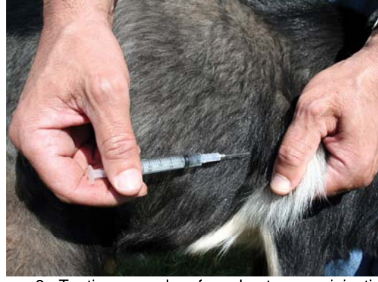
Figure 3. Tenting procedure for subcutaneous injection.

The preferred site for SC injections is the skin just behind the elbow, although they can also be given in the triangular area in front of the shoulders between the top and bottom of the shoulder blade and corner of the jaw. Vaccines often cause swellings or "knots" and a knot behind the elbow indicates an injection site whereas a knot in the neck in front of the shoulder could possibly be confused with a caseous lymphadenitis abscess.